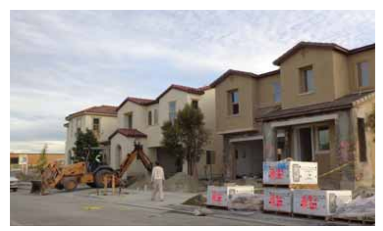
Ridgewood model homes under construction